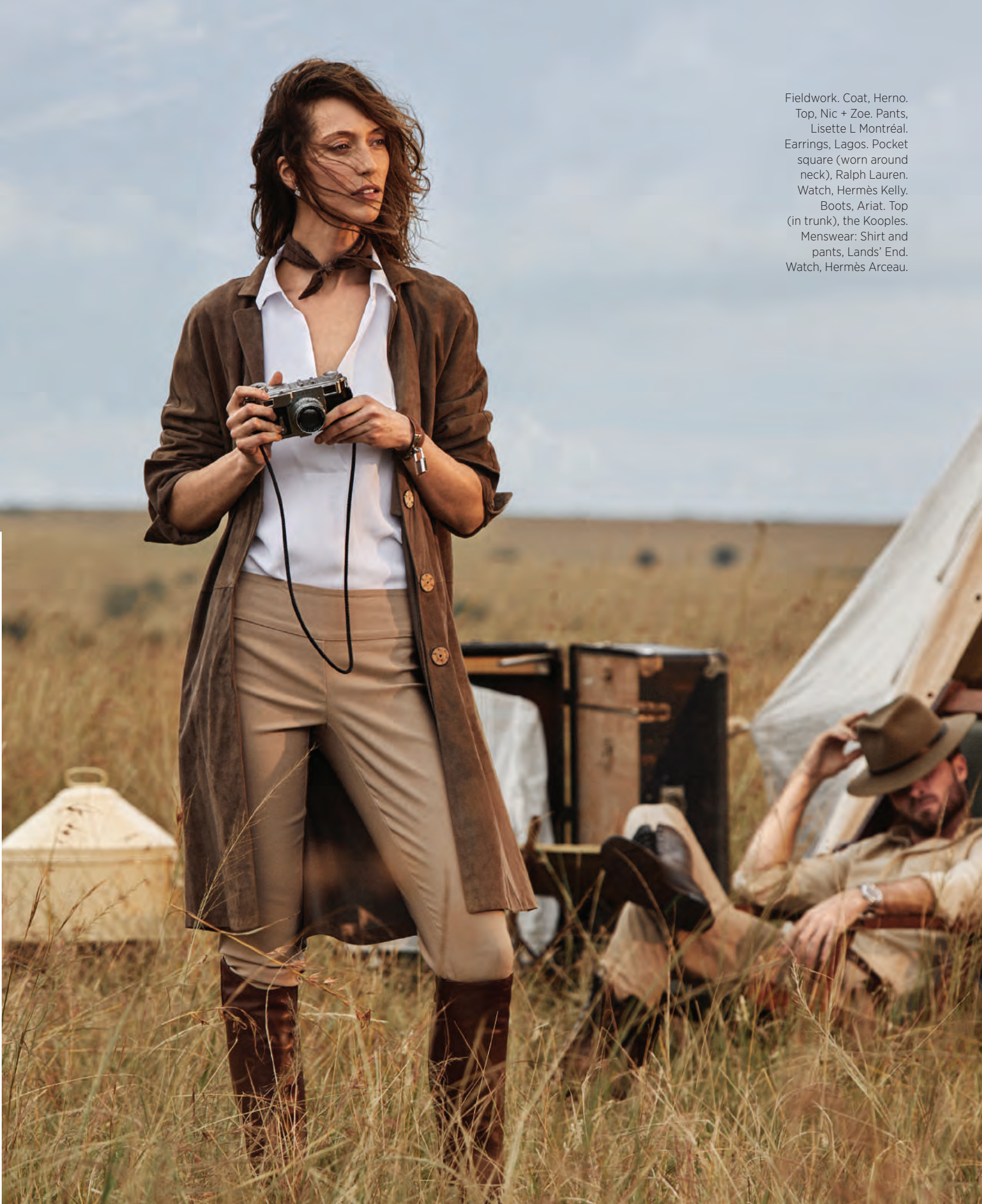
Fieldwork. Coat, Herno. Top, Nic + Zoe. Pants, Lisette L. Montréal. Earrings, Lagos. Pocket square (worn around neck), Ralph Lauren. Watch, Hermès Kelly. Boots, Ariat. Top (in trunk), the Kooples. Menswear: Shirt and pants, Lands' End. Watch, Hermès Arceau.