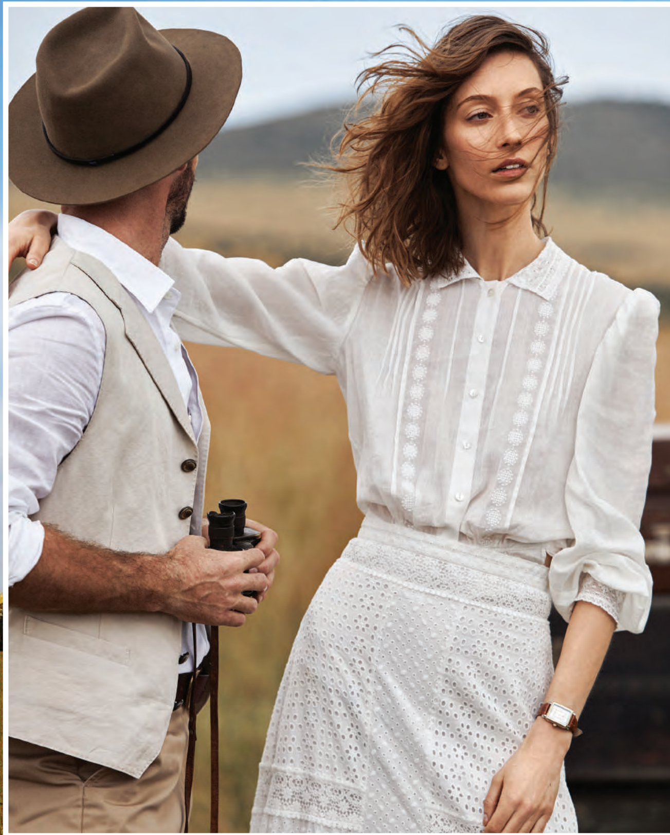
Amber waves. THIS PAGE: Top and skirt, the Kooples. Watch, Michele Watches. Menswear: Waistcoat and shirt, Brunello Cucinelli. Pants, Polo Ralph Lauren. OPPOSITE PAGE: Trench coat, sweater, pants, and belt, Alberta Ferretti. Boots, the Frye Company.