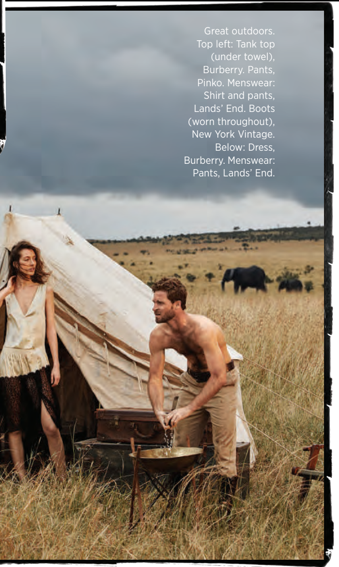
Great outdoors. Top left: Tank top (under towel), Burberry. Pants, Pinko. Menswear: Shirt and pants, Lands' End. Boots (worn throughout), New York Vintage. Below: Dress, Burberry. Menswear: Pants, Lands' End.