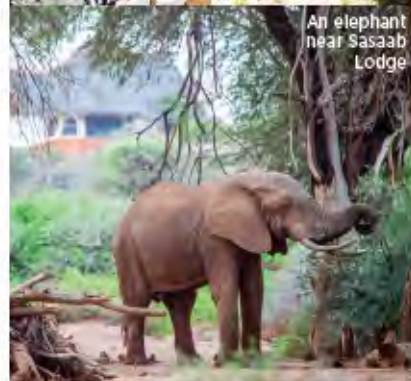
An elephant near Sasaab Lodge