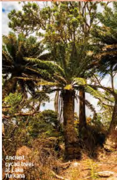
Ancient cycad trees at Lake Turkana