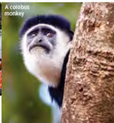
A colobus monkey