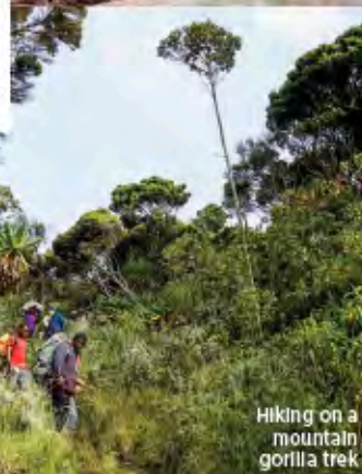
Hiking on a mountain gorilla trek